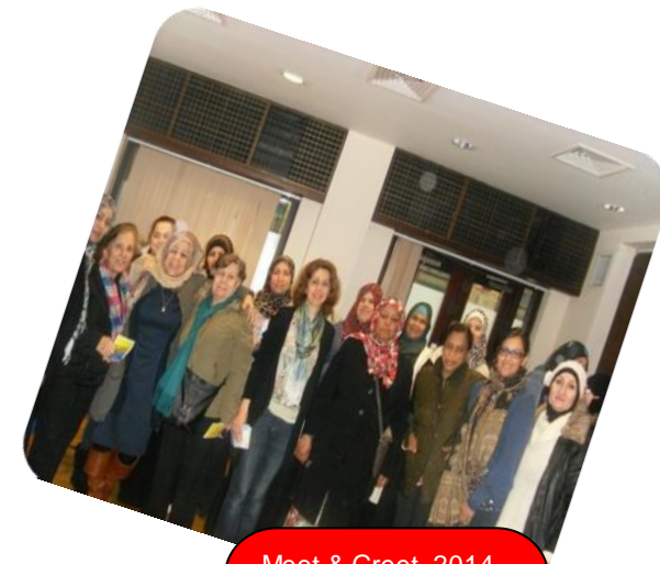
Meet & Greet. 2014

“I really liked the idea of the basic steps to setting up my own business that I can do from home. So we had practical session on decorating candles through to packing gifts. These are simple methods that you can fit in around your children. I will be taking these ideas forward and hope to set my own business and give something back to the economy.” Service User