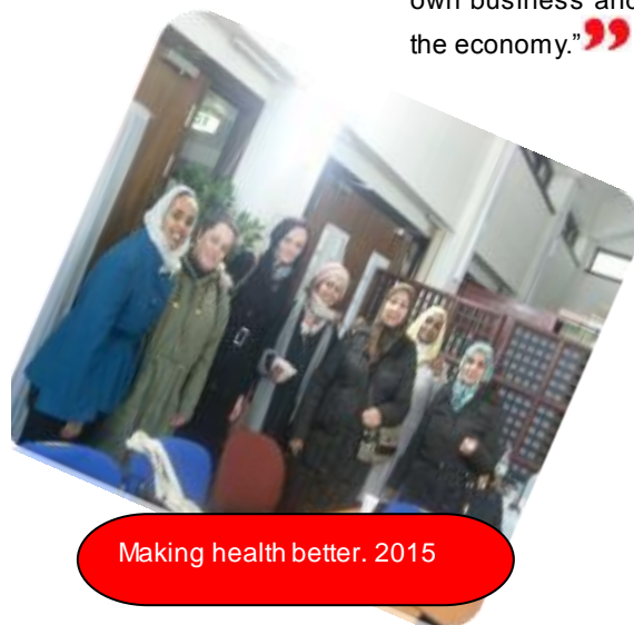
Making health better. 2015

“Hear Women helped me to register with GP that is near to my new home and explained to me what I need to expect from the GP. I would like to thank Hear Women for their support.” Service User