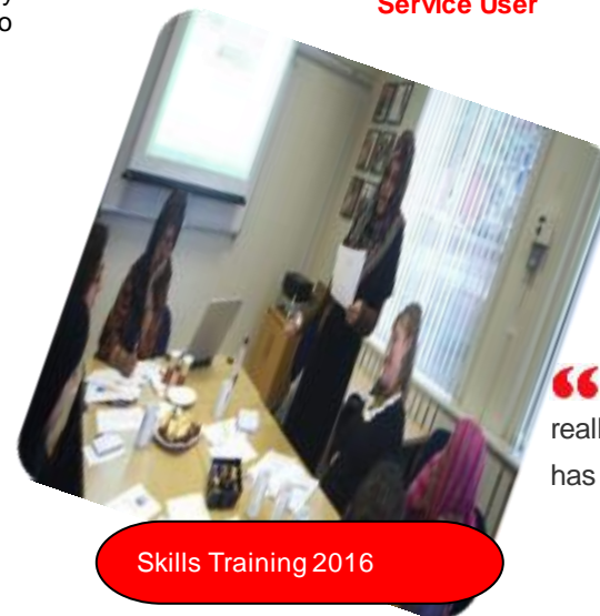
Skills Training 2016

“The sessions have been really useful and 1264 women has benefited from attending”